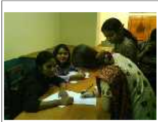
Student Members registering for the Seminar