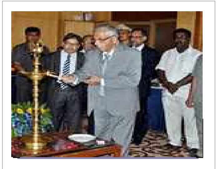
H.E. Shri M.K. Narayanan, Hon'ble Governor of West Bengal Inaugurating the National Convention on International Relations at Kolkata.

The National Convention on International Relations, organized by The Jadavpur Association of International Relations in collaboration with Maulana Abul Kalam Institute of Asian Studies (MAKAIS), African Studies Association of India (ASA), and Indian Council of Cultural Relations (ICCR) and supported by Public Diplomacy Division, Ministry of External Affairs, Government of India has been an extremely fruitful endeavour over a period of 4 days (17th-20th August, 2011). The convention was a success to say the least, and could not have had bore fruits without every one's participation. The objective of this National convention, one of its kind, has been to discuss India's constructive engagement in Asia and Africa in the twenty first century. What makes it different and intriguing from the usual conferences are the various approaches of discussion undertaken, be it through special lectures, cultural events or documentary film shows. The Jadavpur Association of Inter-