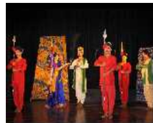
Tasher Desh organized by ICCR in connection to the National Convention organized by JAIR