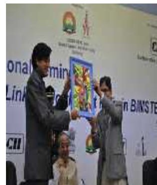
Felicitating Dr. Tharoor at Shillong Conference