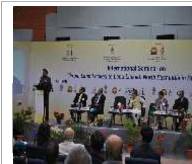
Dr. Shashi Tharoor delivering the key note address at Shillong Conference

of External Affairs, Government of India, diplomats from most of the BIMSTEC countries including the Ambassador of Myanmar and Thailand to India, High Commissioner of Bangladesh, academicians of highest repute and young scholars and students of International Relations. The proceedings of the seminar were forwarded by the association in the format of possible policy inputs to the MEA and efforts to produce a scholarly volume on