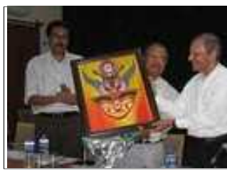
Felicitations of Ambassador Ronen Sen at JAIR

Groups Appreciate India's Concerns & Priorities: A Public Diplomacy Exercise Abroad on the Day was delivered by former Foreign Secretary, Ambassador Ronen Sen on 13th September, 2010. The Programme was attended by journalists, teachers and students.