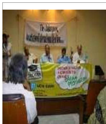
Formal Launching of JAIR

which has imparted JAIR with a unique identity. It has become a familiar name not only in the eastern region but across India by the sheer dint of the fact that it is one of the very few registered forums that has tried to sensitize the society with the issues of International Relations. A country like India, where foreign policy matters hardly form an issue, the efforts of the JAIR towards awareness building has been noteworthy. The association has been unwaveringly working since its very inception towards knowledge dissemination primarily among the young scholars of International Relations by encouraging the culture of discussion and active deliberation on matters